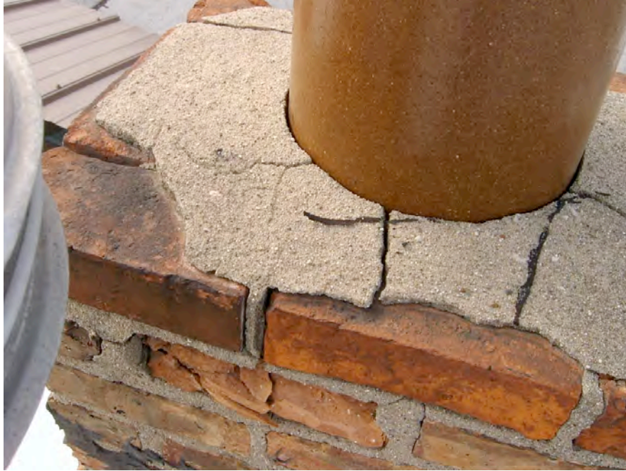
Figure 3 North chimney. Note deterioration of brick & cap