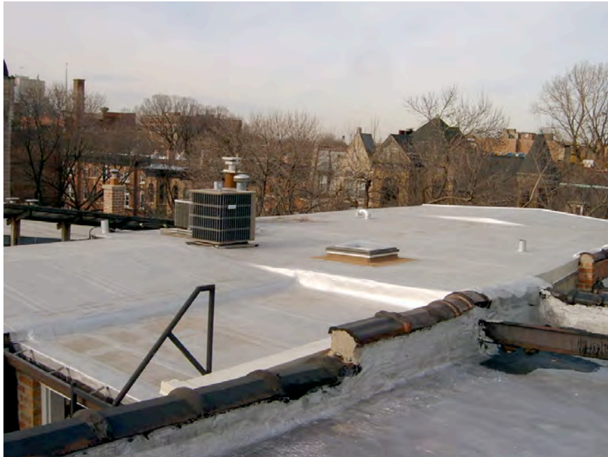
Figure 1 Roof