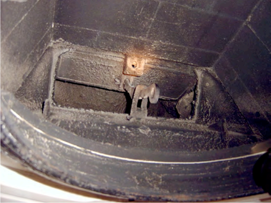
Figure 5 Accumulation of soot and creosote in living room chimney