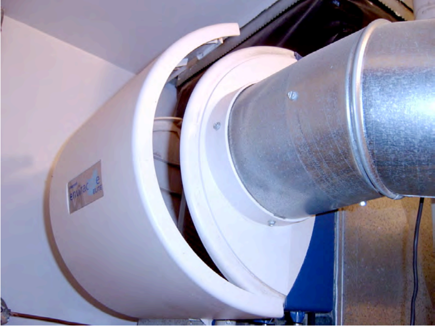
Figure 9 Loose cover on lower humidifier