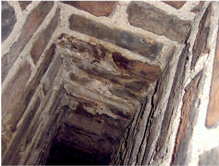
Figure 4 Unlined fireplace chimney