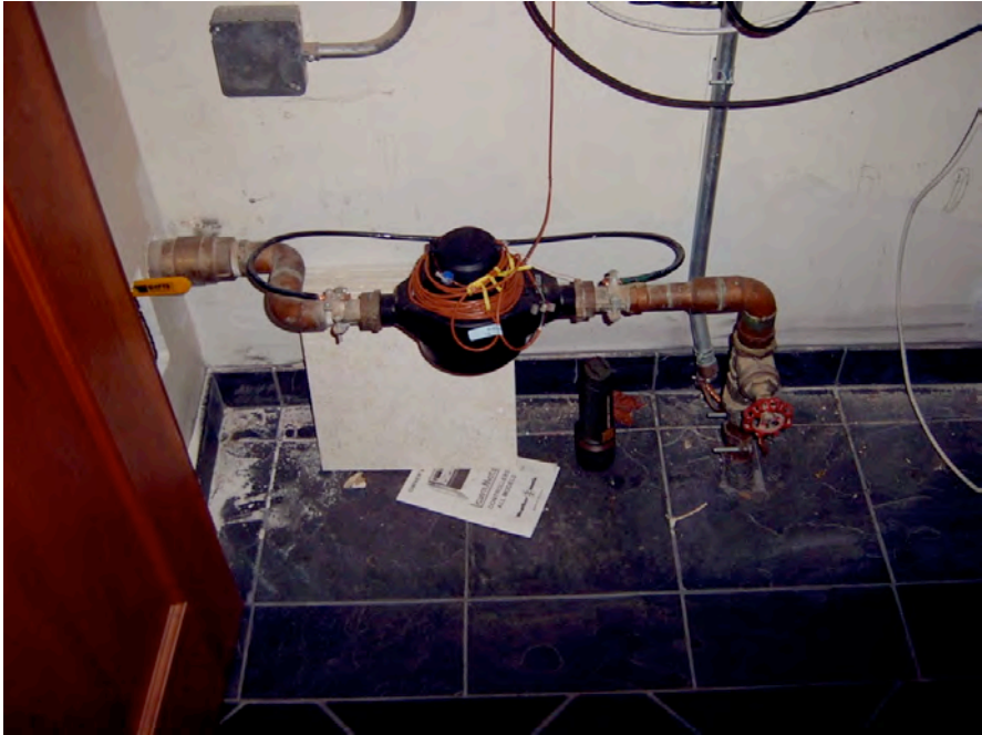
Figure 12 Main water shut off