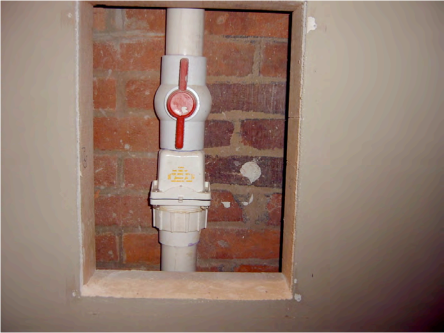
Figure 6 Shut off valves for ejector pump (behind panel in closet)