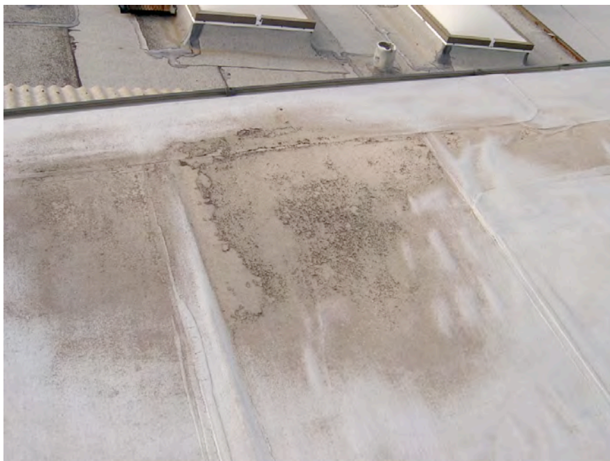
Figure 2 evidence of ponding on roof