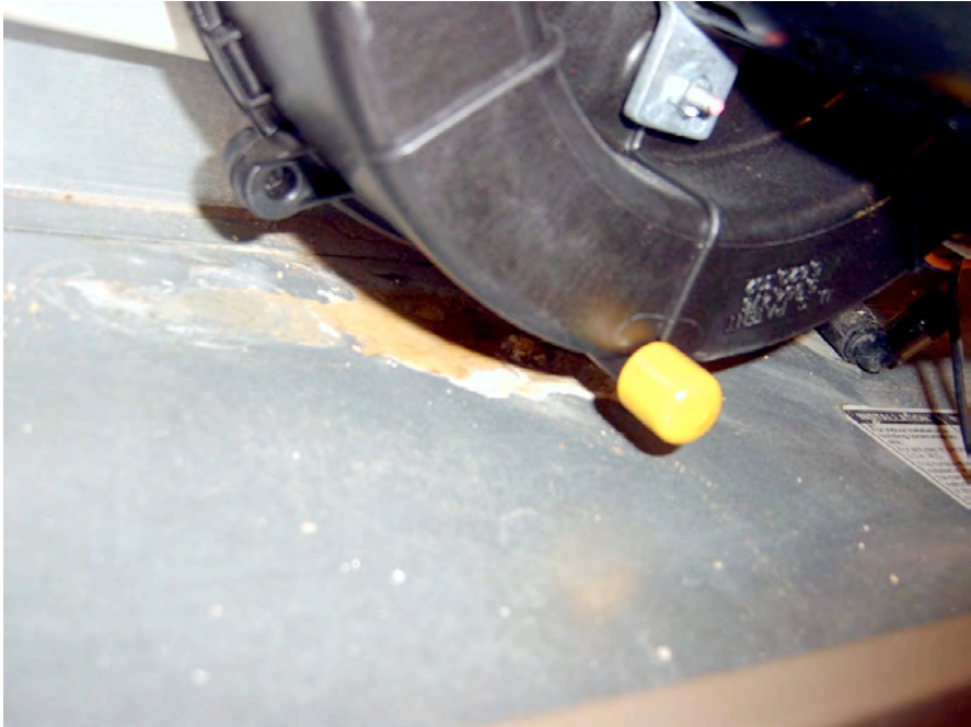
Figure 8 Condensate leakage under induced draft of lower furnace