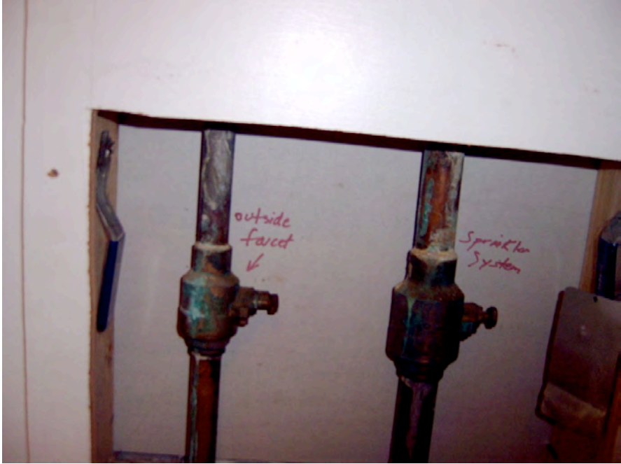
Figure 7 Shut off valves for outside faucets behind cover in lower level furnace room