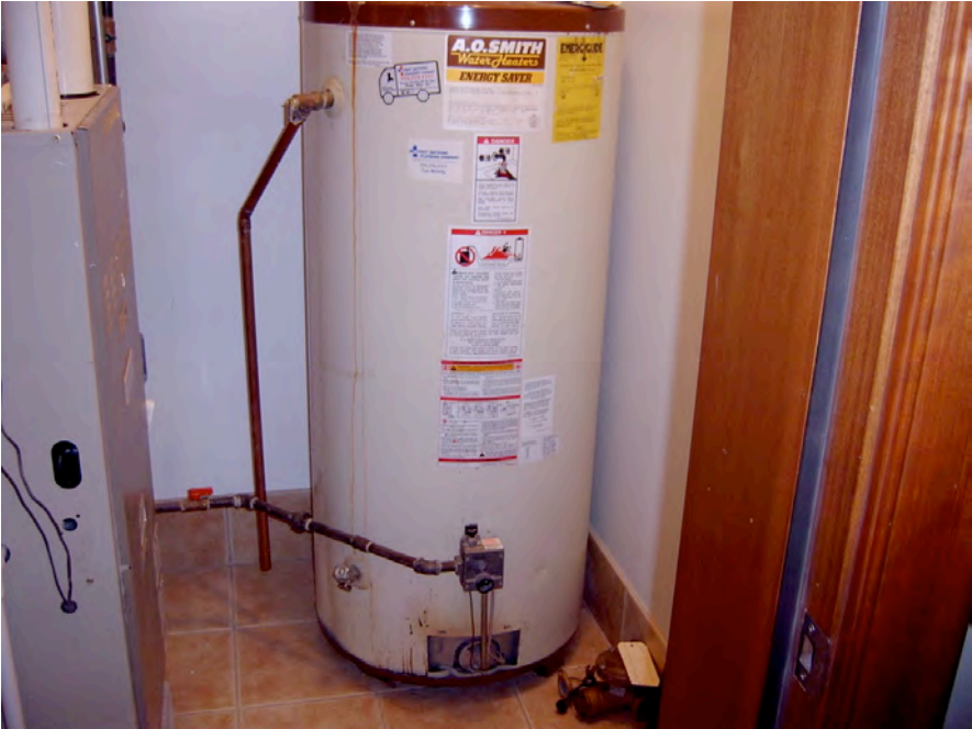
Figure 10 Water heater. Note missing burner cover.